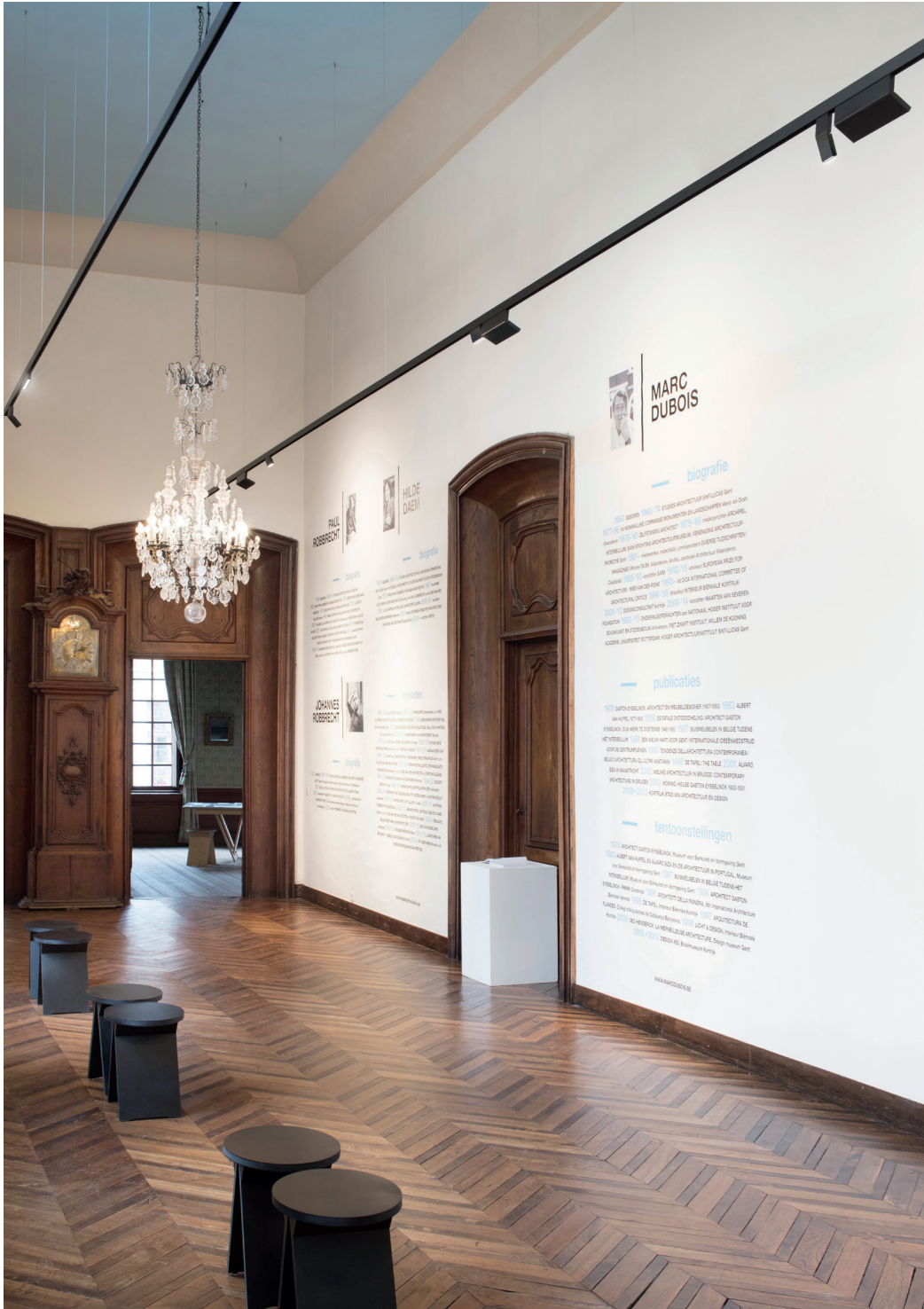
°online suspended track / Design Museum Gent, Belgium