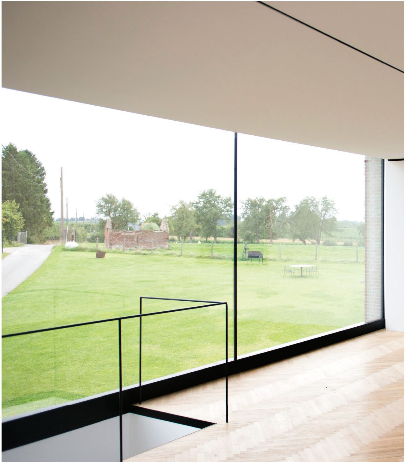
°in & °turn / Gert Robijns - Reset Home, centre for contemporary art