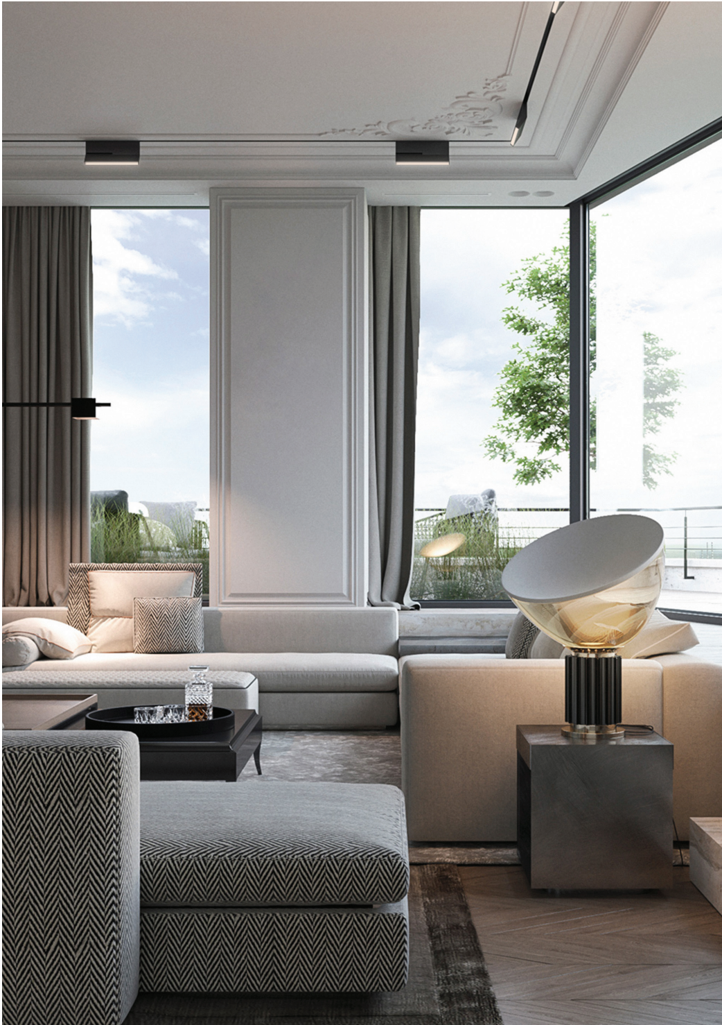
*knick / Penthouse, Ukraine - architect NOTT Design Studio (Sergey Gotvyansky, Mikhail Temnikov)