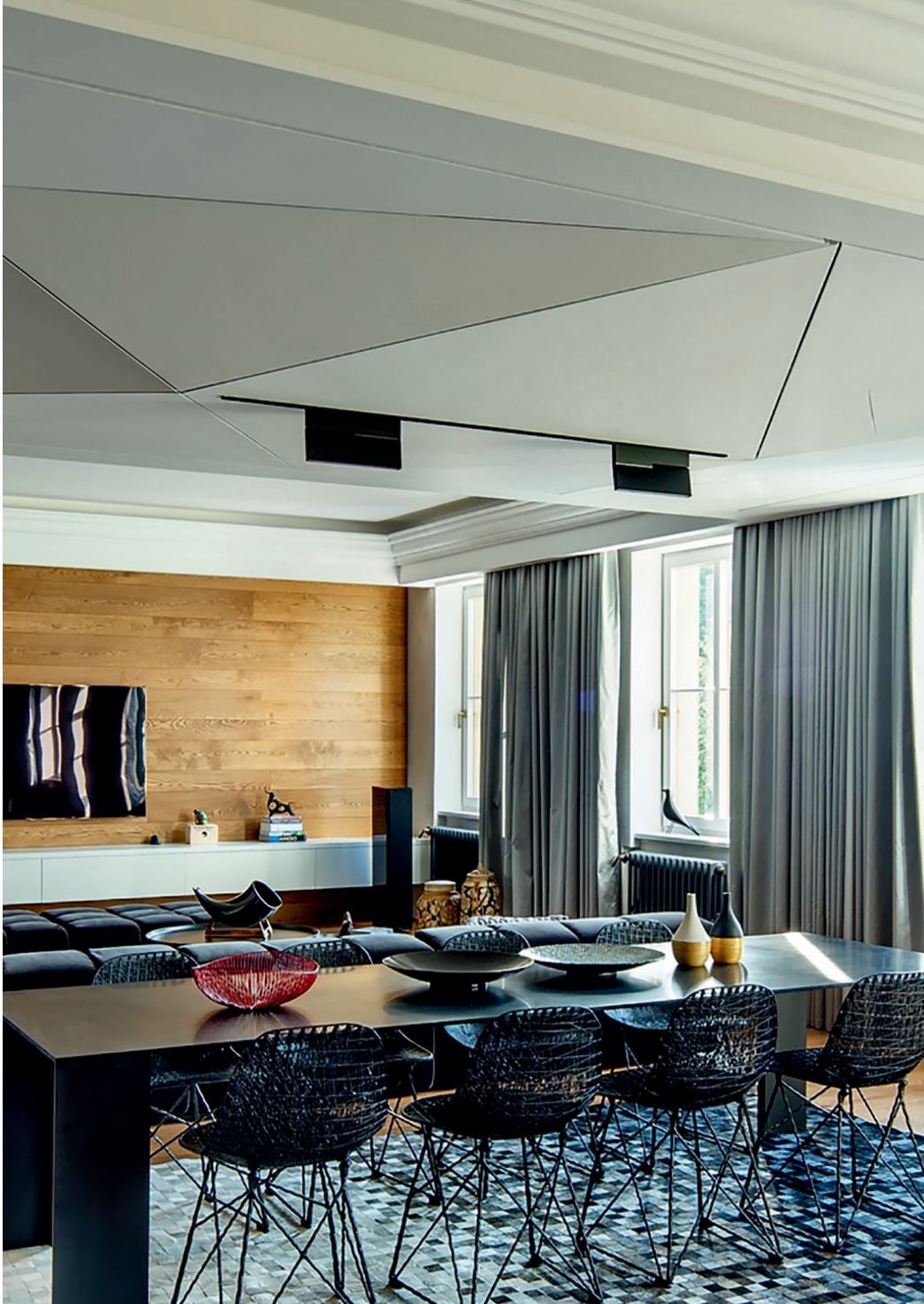
*knick / Men's Choice II, Slovakia - architects AT26