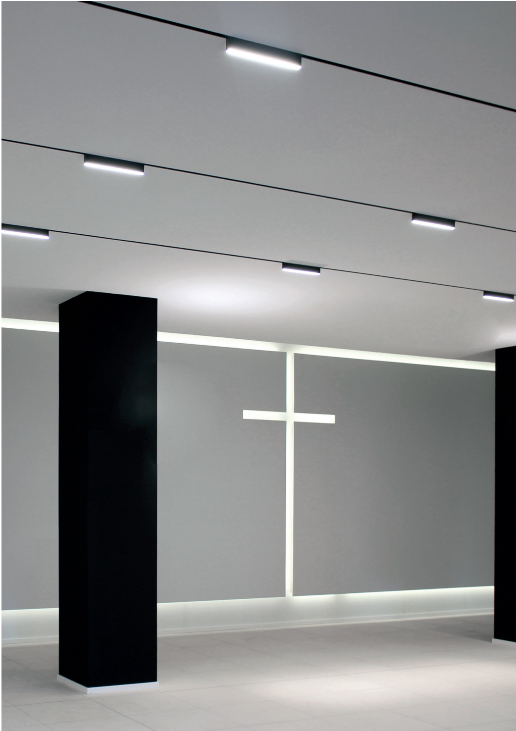
*out / Church Genk, Belgium - architect PCP Architects