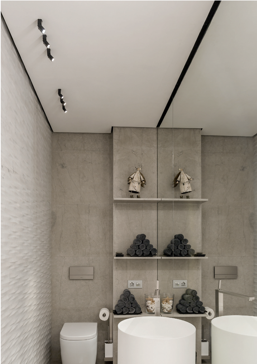
°dot monopoint with plasterkit / Grey Perfection, Moscow - architect Dina Mezheva