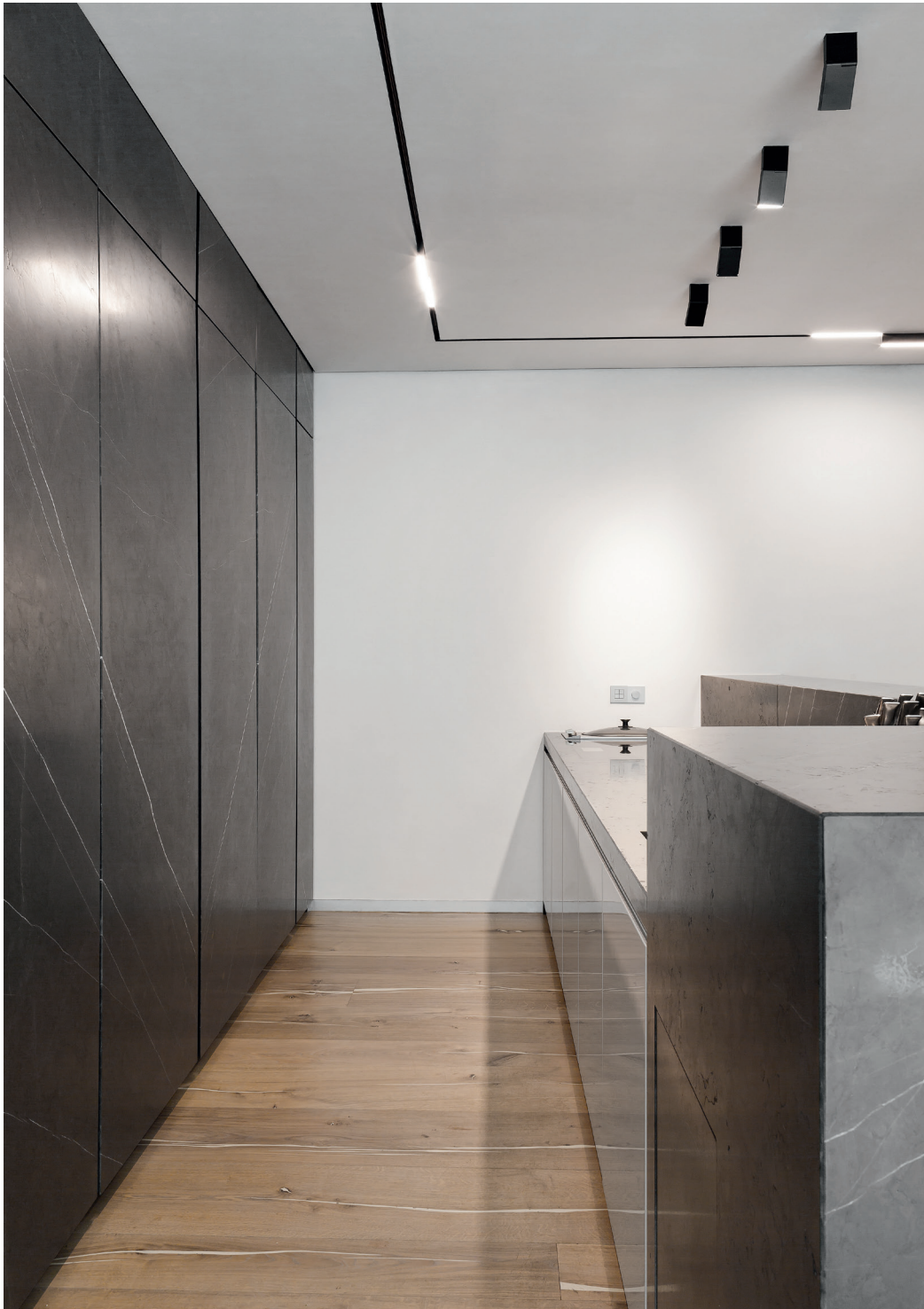
°turn monopoint with plasterkit & °knick / Grey Perfection, Moscow - architect Dina Mezheva