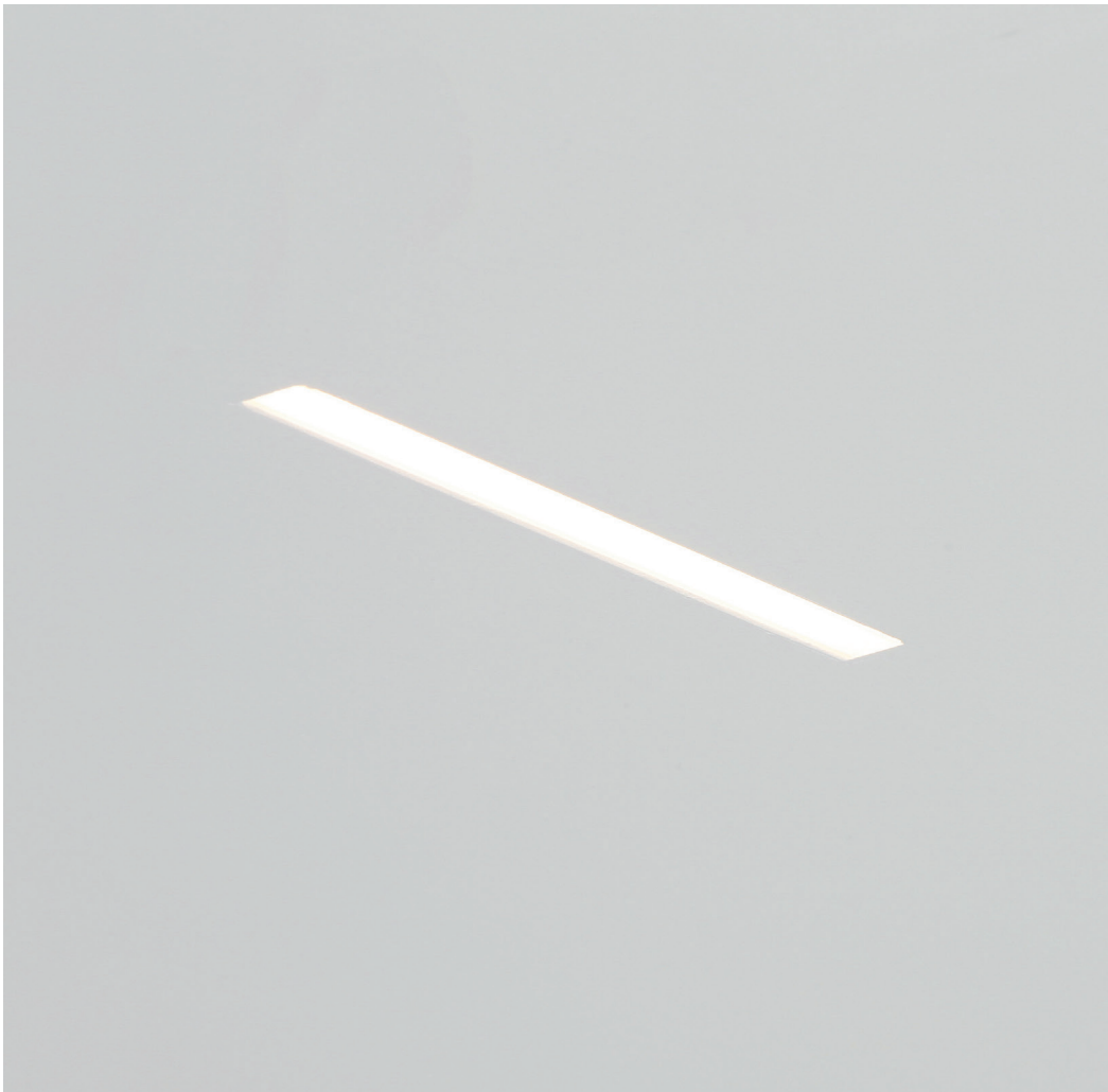
°in monopoint with plasterkit