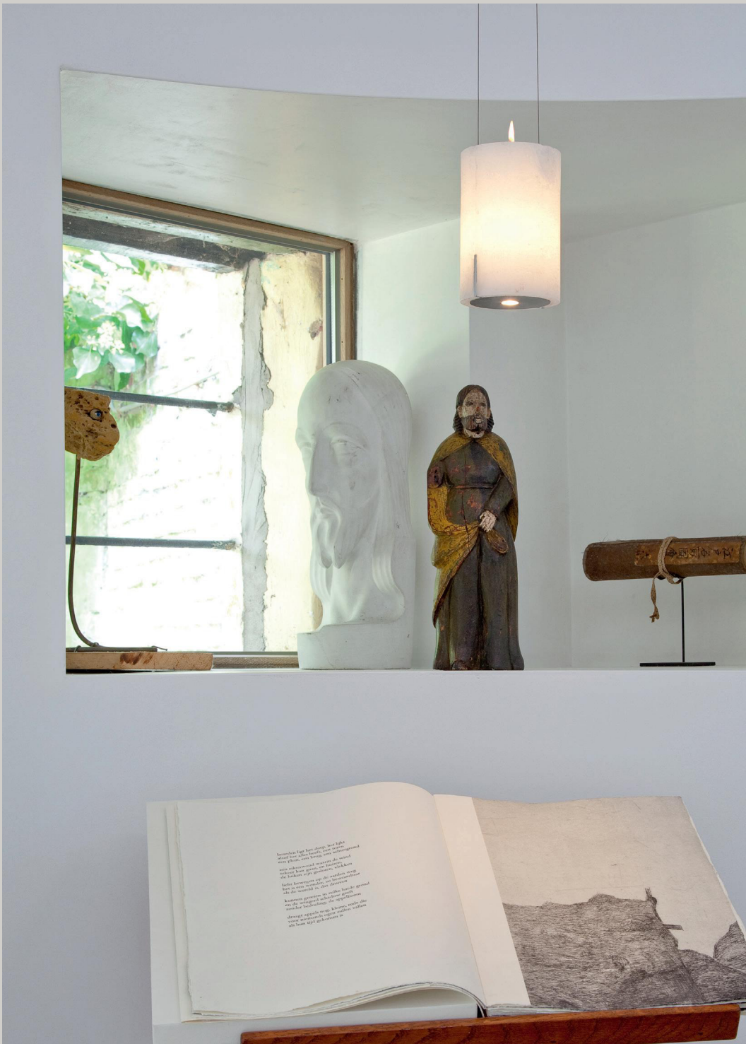
Atelier Ploegaert - architect Lens o ass - photograph by Bieke Claessens