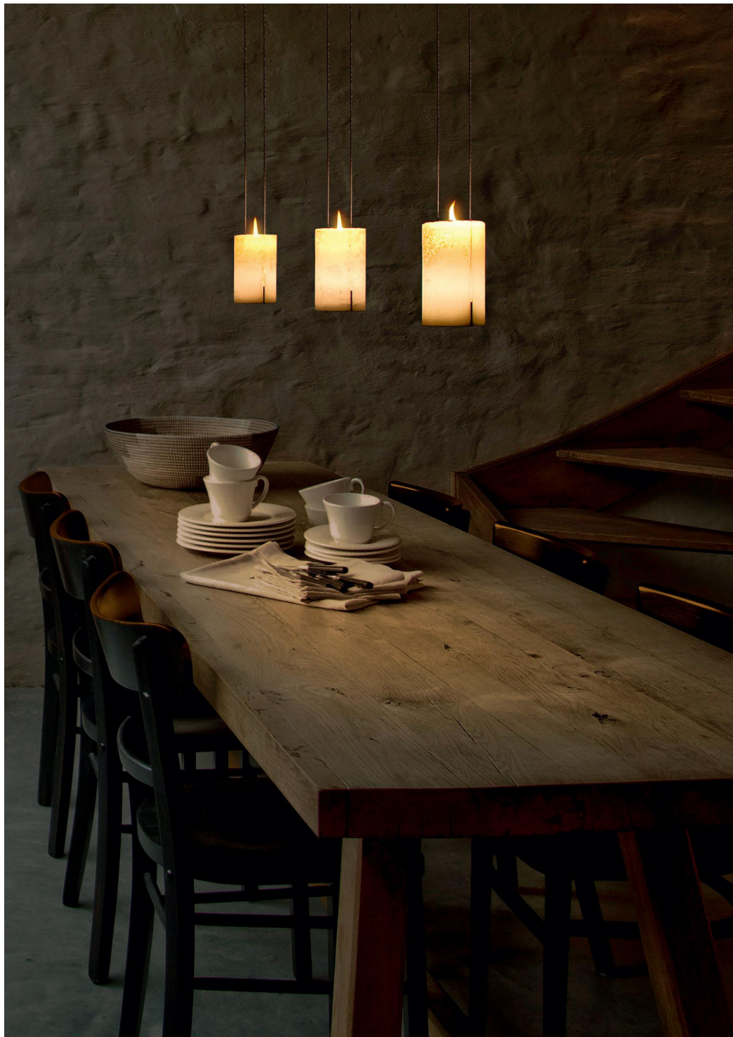
Nieuwpoort, Belgium - architect Lens°ass - photograph by Bieke Claessens