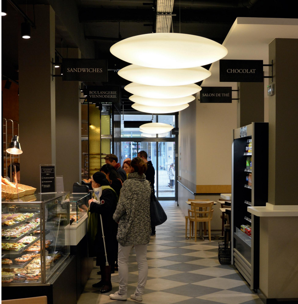
°fool moon medium / Maison Bettant, Lyon - architect Mona LISA - Christophe Millet - light design Inédit