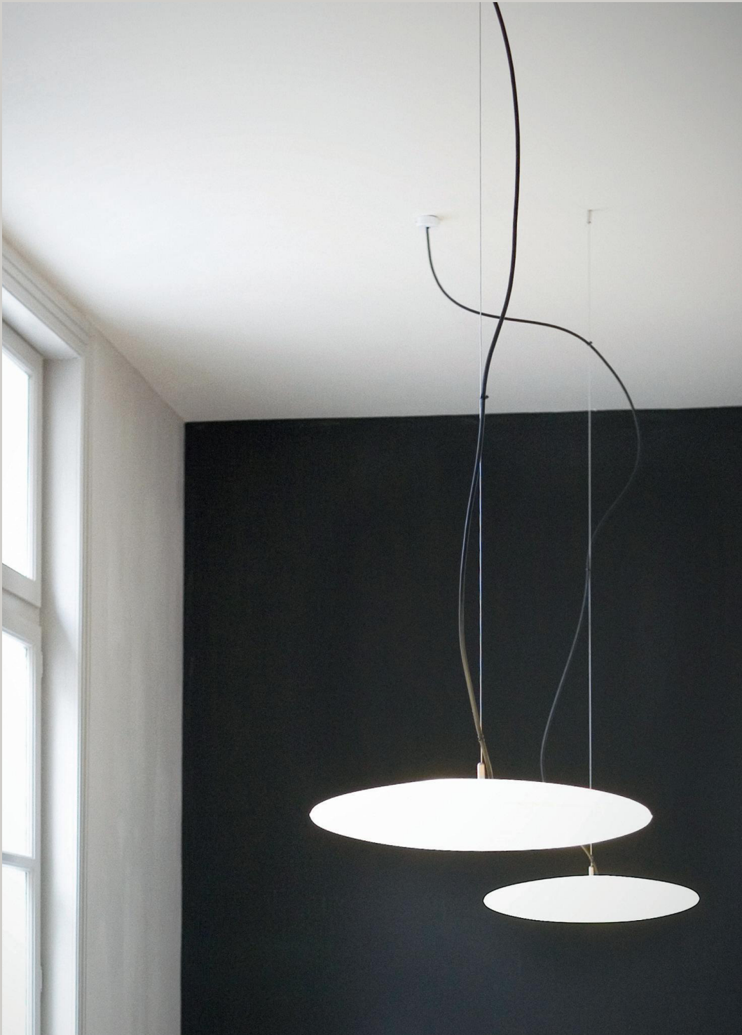
°fool moon small / Dell'anno - architect Lens°ass - photograph by L.Descamps