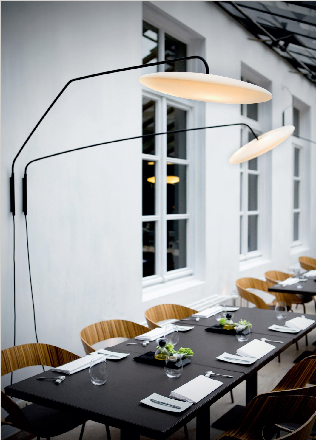
°fool moon wall 1 / Dell'anno - architect Lens°ass