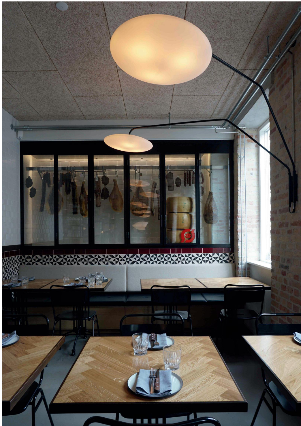
°fool moon wall 1 / Christian Puglisi's restaurant BÆST, Copenhagen - architect Fobsi Studio