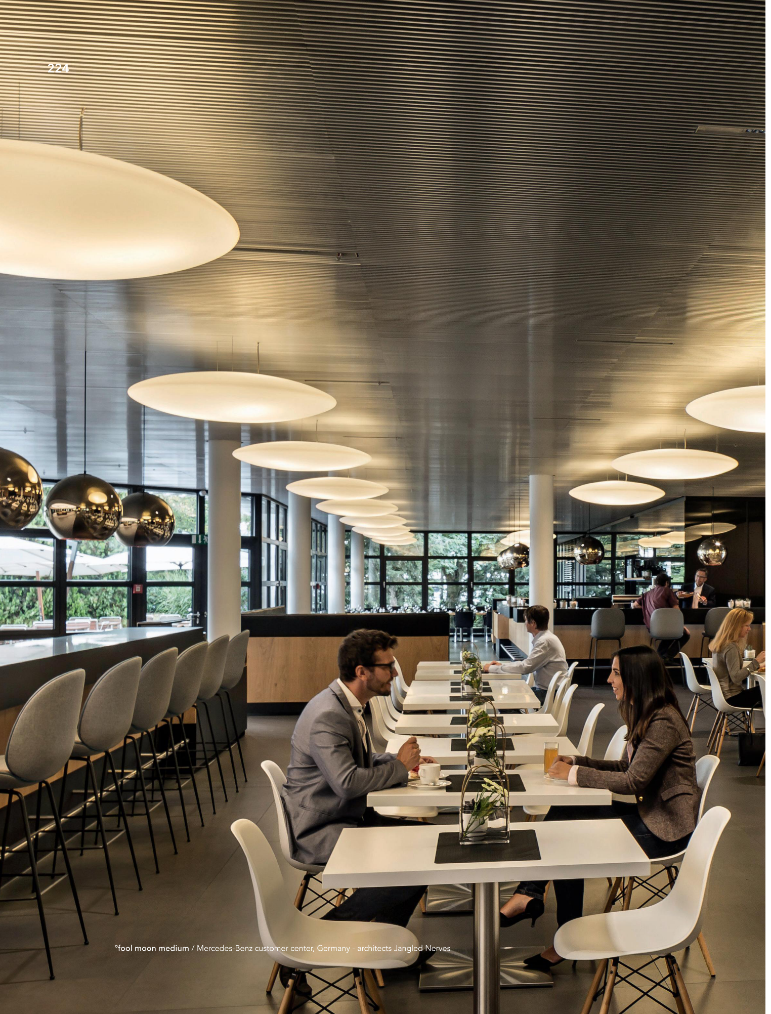
fool moon medium / Mercedes-Benz customer center, Germany - architects Jangled Nerves