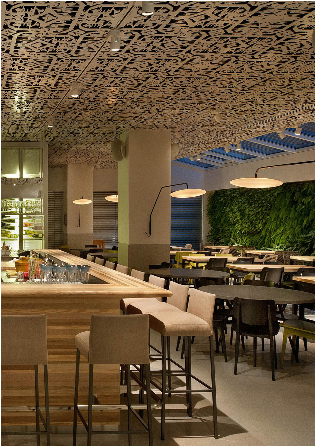
*fool moon wall 1 / Mendeli Street Hotel, Tel-Aviv - ST-OR - lighting designer Ailon Gavish, Studio Twilight