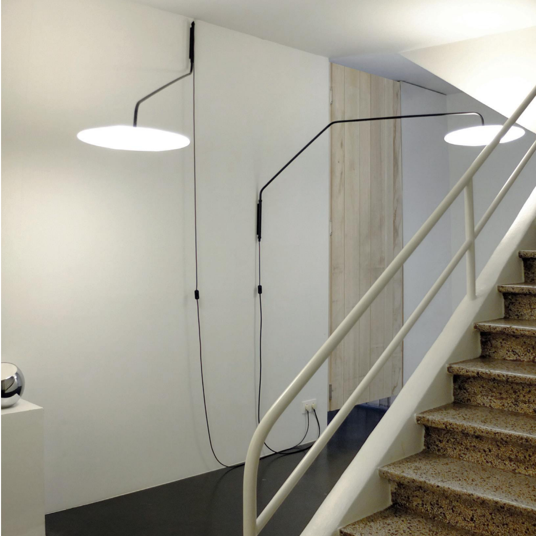
°fool moon wall 1 & 2 / Office hall, Hasselt - architect Lens°ass