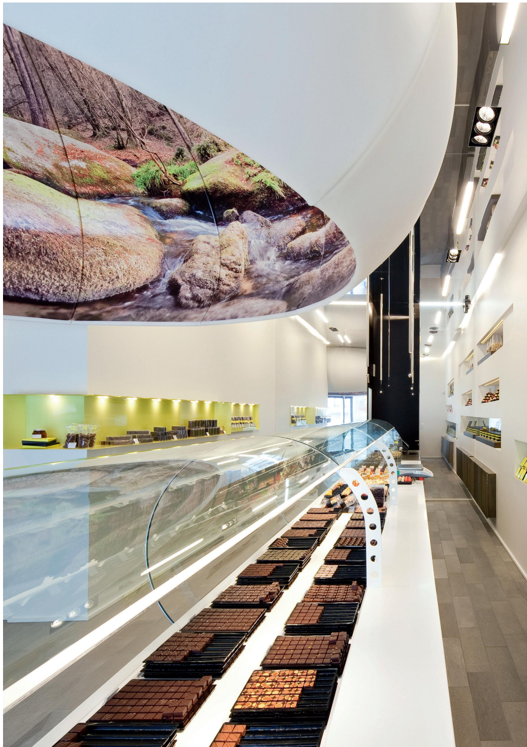
C Chocolat, Brest - architect Trace & Associes