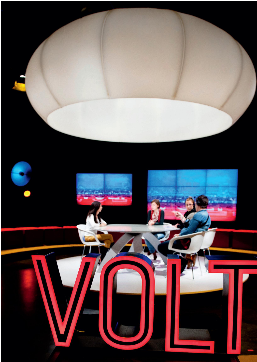
Belgian TV-show 'Volt'