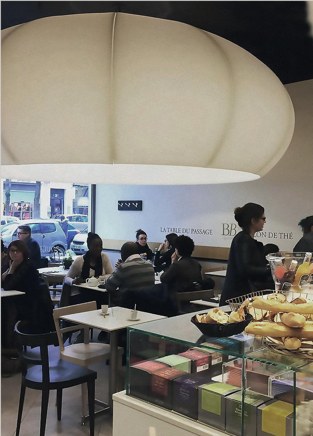
Maison Bettant, Lyon - architect Mona LISA - Christophe Millet - lightdesign Inédit