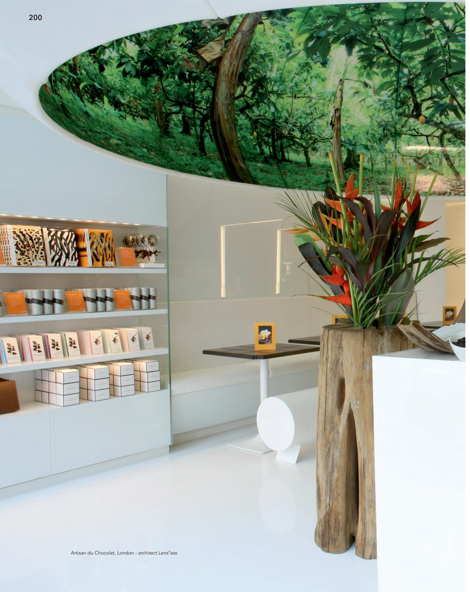
Artisan du Chocolat, London - architect Lens'ass