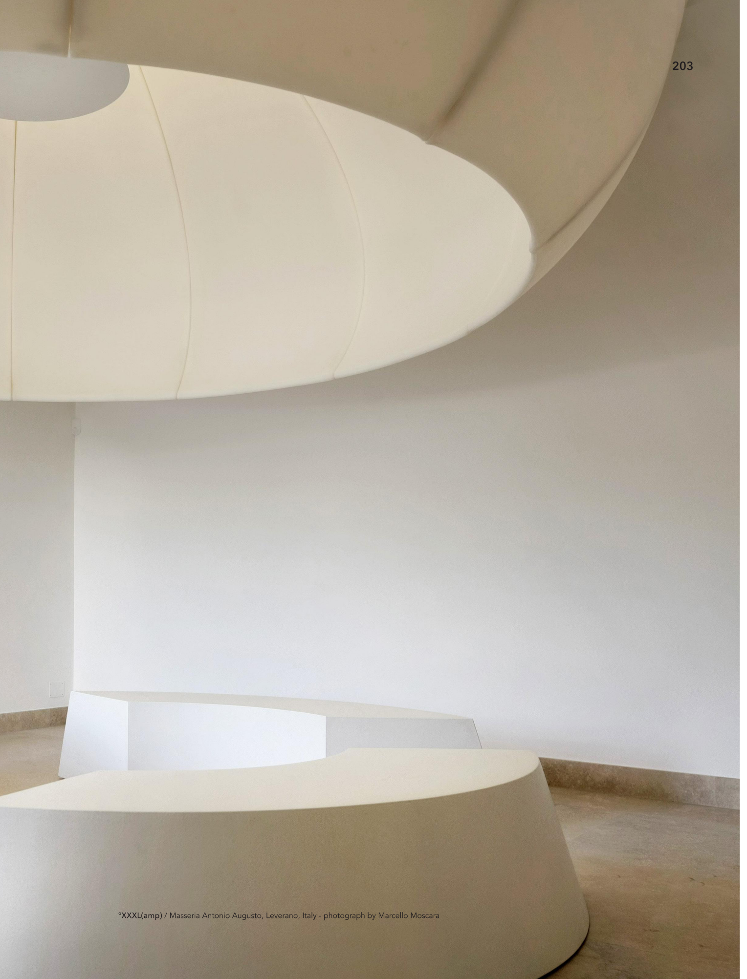
°XXXL(amp) / Masseria Antonio Augusto, Leverano, Italy - photograph by Marcello Moscara