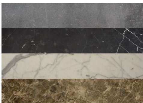
Carrières du Hainaut 1

Included, if dimmable: DALI, DSI, switchDIM